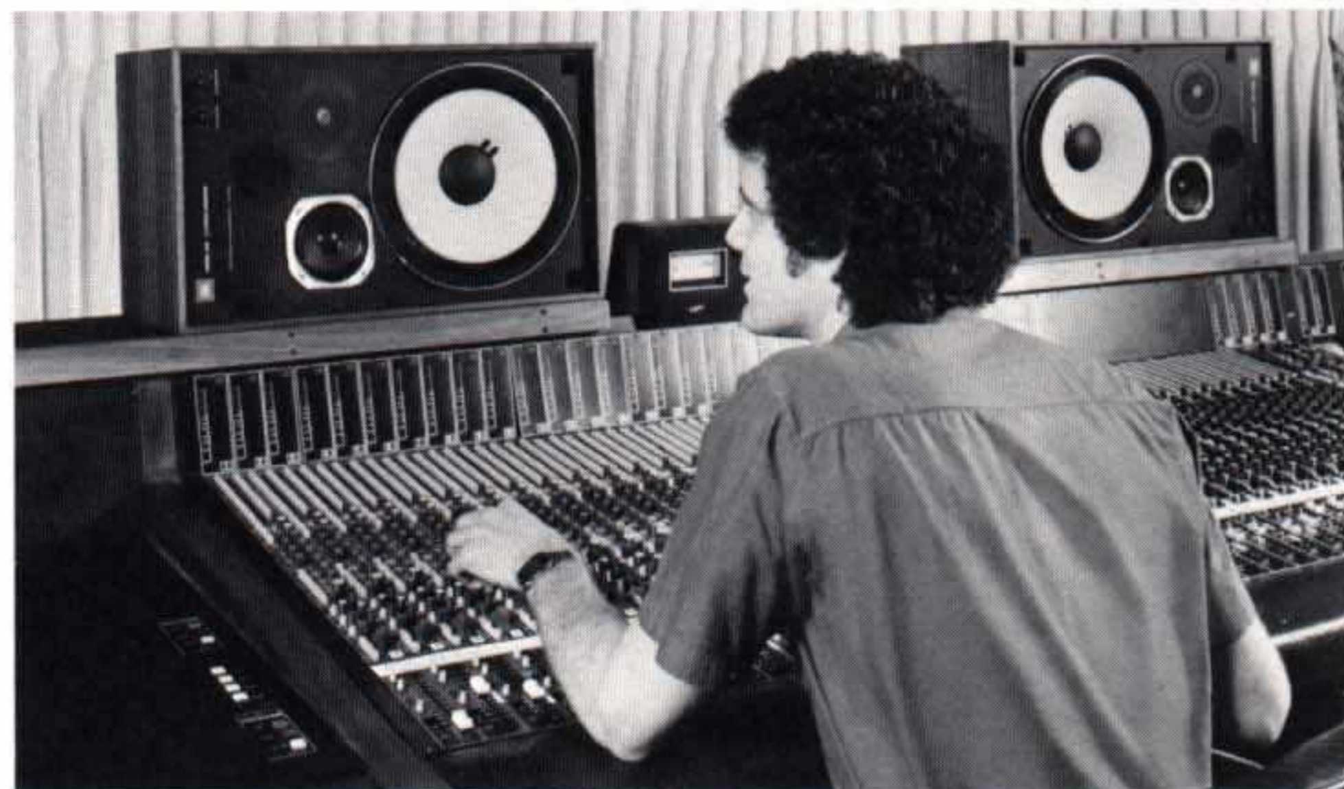
Photographed at Westlake Studio, Los Angeles, Calif.

One reason studios choose JBL (in addition to the good sound) is that JBL loudspeakers are simply built better. The attention to detail is obvious when you look at the oiled walnut